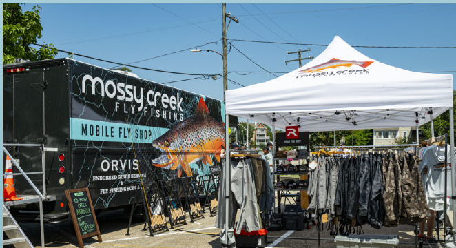
MOSSY CREEK MOBILE STORE

Finally, I want to thank you for being a part of the Virginia Coastal Fly Anglers. It is a good group of men and women and I am happy to serve you. I want the club to be relevant to everyone and keep it moving forward. Your participation is essential to that goal and your feedback will help us to explore new things to make it relevant.