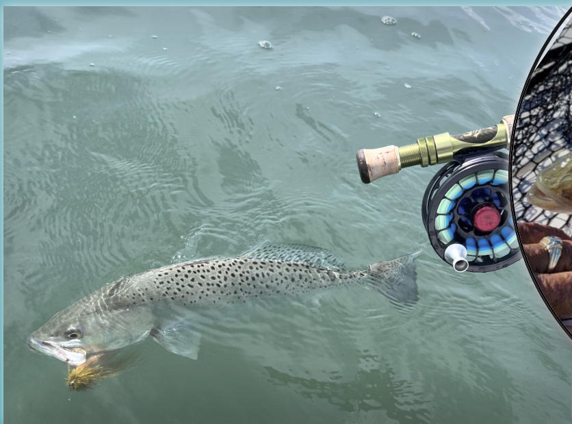
Kevin Dubois, Speckled Trout